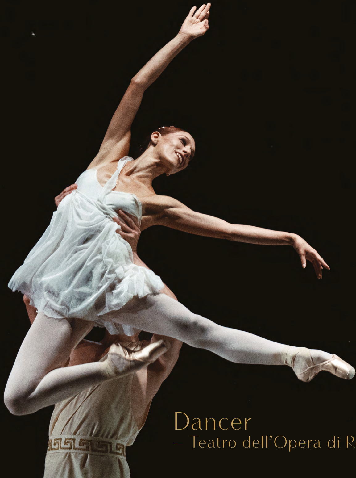
Dancer – Teatro dell'Opera di Roma